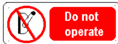
TO BE PLACED ON CONTROL PANEL