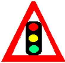
TRAFFIC SIGNAL AHEAD SIGN

* Proper signage must be placed at appropriate locations to guide and warn all drivers and other airport users of the work.