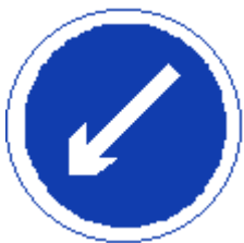
KEEP LEFT SIGN