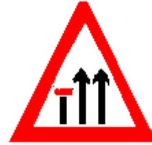
LANE CLOSURE AHEAD SIGN