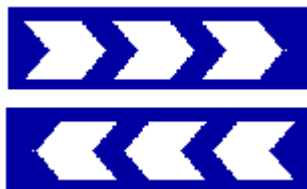
SHARP DEVIATION PLATES