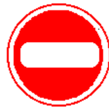
NO ENTRY SIGN