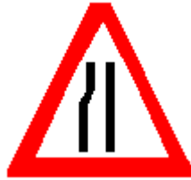
ROAD NARROW AHEAD SIGN